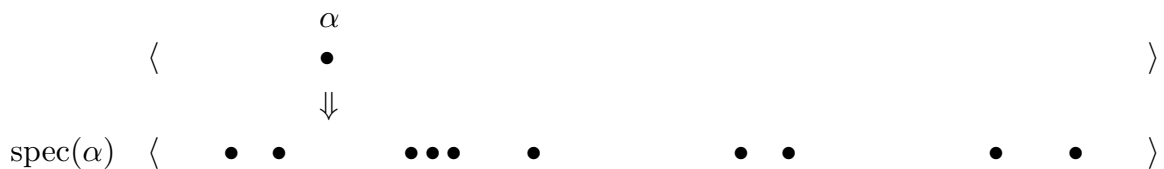
Figure A. Each real number \alpha determines \text{spec}(\alpha) , a countably infinite subset of the reals.